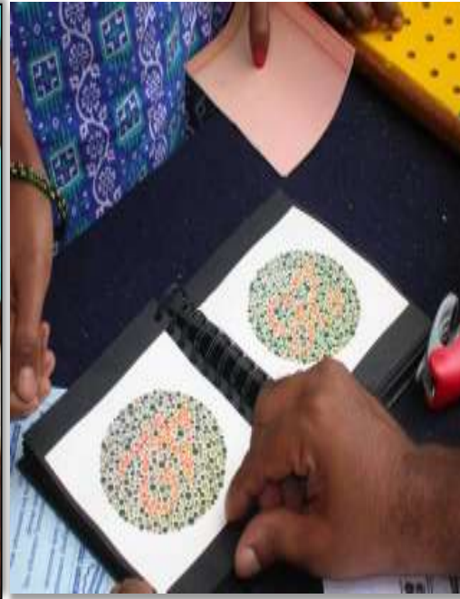
Colour Blindness test