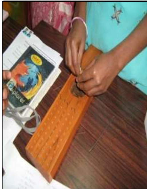
Finger dexterity test